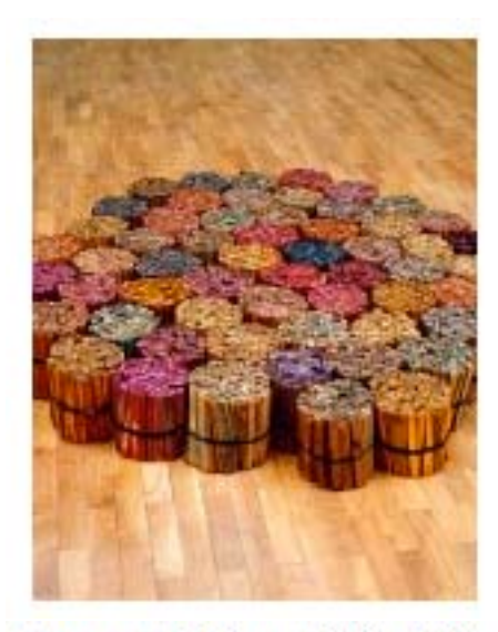
"Legnetti Colorati" (1968), wood, synthetic polymer paint, elastic bands

"Cubo" (Cube) is a mash up of wood, fiberglass, cardboard, plastic, glass, rubber, polystyrene, steel rods and wire wool all glued together and viewed through a Plexiglas box. In "Legnetti Colorati" (Little Colored Sticks) bundles of common wood are artfully arranged to create a blossom pattern on the floor.