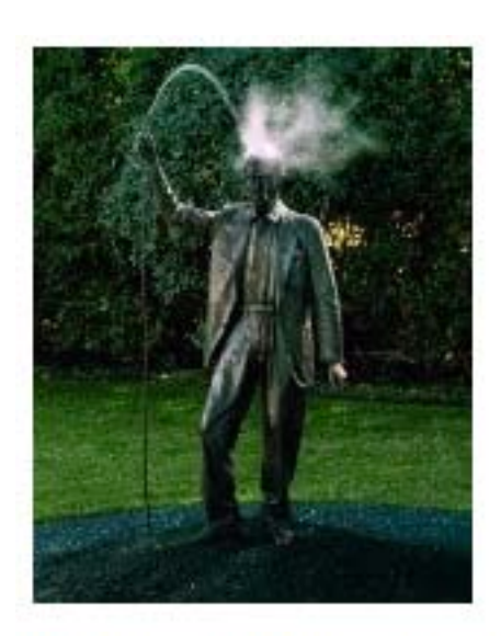
"Self-Portrait" (1993), bronze and electrical and hydraulic components

Leaving the exhibition, I felt that my head could use some cooling off. There was so much to see by this enigmatic Italian artist, impossible to classify in his all too brief 54 years. Fitting then to end the exhibit with a visit to the sculpture garden with Boetti's self portrait in bronze, made a year before he died. The figure holds a hose with running water above his head. As the water hits the head -- engineered to run hot during museum hours -- a cloud of steam is released.