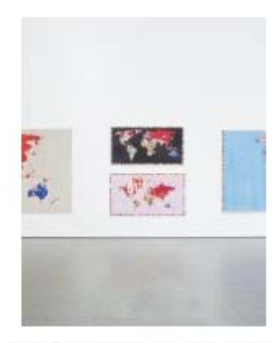
Installation view showing maps

The progression of time intrigued him and he had a particular interest in his own mortality. In "16 Dicembre 2040-11 Luglio 2023" (December 16, 2040-July 11, 2023) Boetti has embroidered two dates: one foreshadowing his 100th birthday and the other his death date. Macabre, yes, but also indicative of his wicked sense of humor.