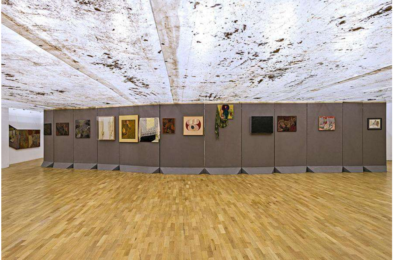
'Kai Althoff goes with Bernard Leach', installation view, 2020.

The first pictures you may encounter are works on paper in gouache, oil and ink (all Untitled , 2017–18), inspired by the Japanese art of Ukiyo-e . Dainty flecks, spindly lines and sparing washes describe an anthology of unsettled scenes – eerie settlements, blood moons, intimations of supernatural threat. As much as woodblock prints, the works call to mind Masaki Kobayashi's 1964 film Kwaidan . Nearby, on trapezoid canvases, pigs are portrayed snuffling through close-toned striations. Something pungent eludes unearthing.