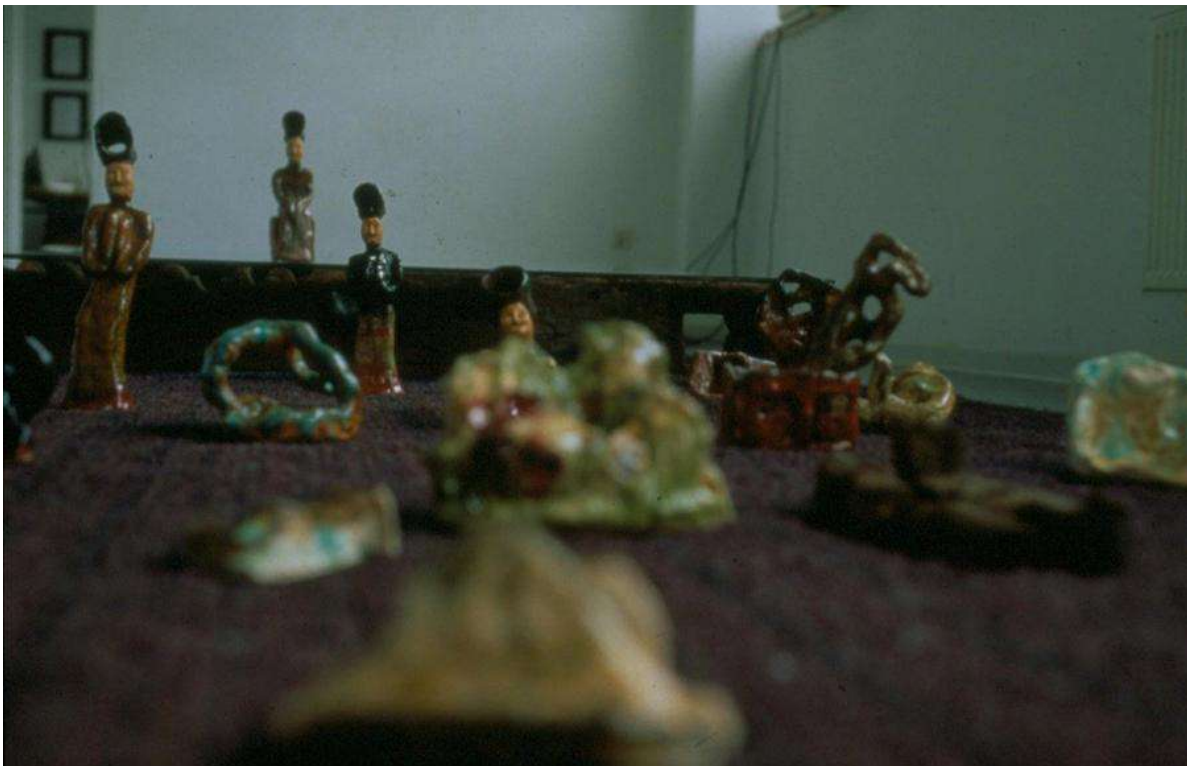
Kai Althoff, Hakelzug , 1994, clay sculptures on sisal rug, two antique wooden beams from a loom, glass panel, wool, green wooden bucket, installation view, Galerie Christian Nagel, Cologne, 1994.

Althoff's cultish status rests in part on the unfolding intrigue of his installations. Upstairs, the final room pulls the whole exhibition into a different focus, like looking through the wrong end of a telescope. Arranged on Alpaca wool fabric, woven by Travis Meinolf, are vessels, dishes, brooches and buttons in raku , earthenware and stoneware by Bernard Leach – who picked up techniques from Japan before fusing them with British ceramic traditions. The discreet organic colour and sensuous presence of the pottery is complemented by the gentle arpeggios of the textile. Riffing on Althoff's own meditations on the natural world and exotic roving, the display calls the ethics of both artists' work into question. Leach has not escaped detection of Orientalism, and the alliance may be a sideways rejoinder to critical discussion of Althoff's 2018 exhibition at Tramps in New York for which he was accused of perpetuating othering stereotypes. Hanging opposite, a childhood felt-tip scrawl by Althoff ( Untitled , c.1969) complicates the equation, the artist perhaps identifying with an oblivious innocence.