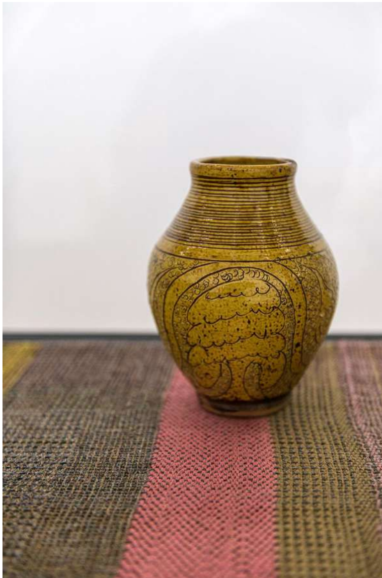
'Kai Althoff goes with Bernard Leach', installation view, 2020.

On a snaking divider screen, furtive elfin figures bring a haul of shellfish ashore ( Untitled , 2020), or take a wheelchair-using friend for a restorative turn round a garden ( Untitled , 2018). Where narrative sense is obscure, meaning seems more likely to reside in haptic details. Paper stained by a spilled beverage crumples as if grasped by a hand ( Untitled , 2010), canvas sags morosely, lambswool becomes haunting curtains ( Untitled , 2002). Impish collage – children’s stickers, chuckling men in hard hats – disrupts your germinating response ( Untitled , 2010, and Der Beste Ausweg , The Best Way Out , 2002). Irreducibility is a central tenet.