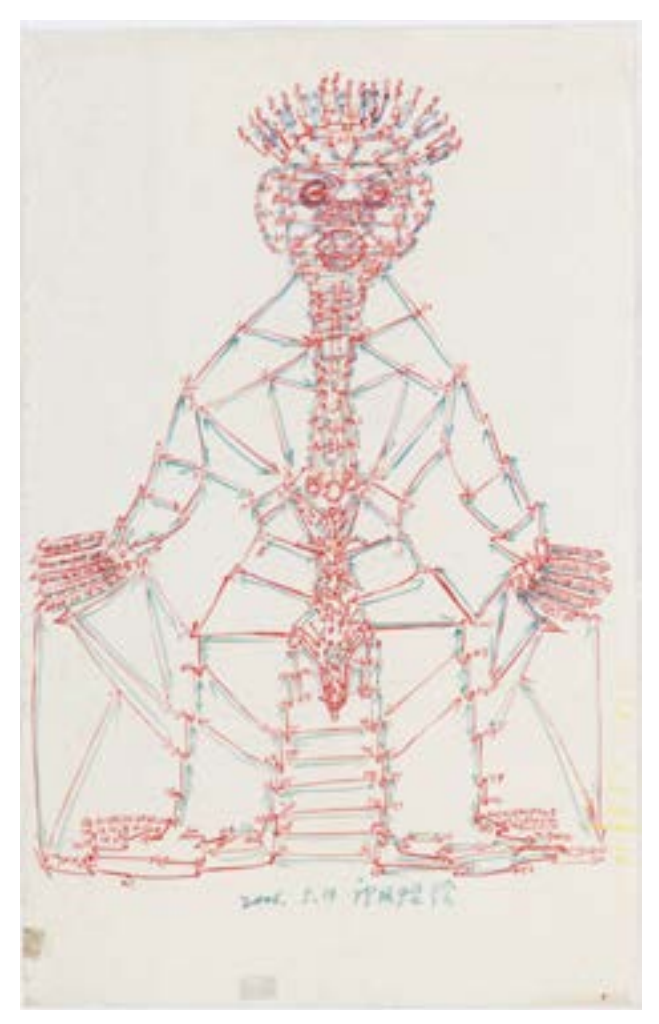
Guo Fengyi, Organization Diagram of Human Numeric, 2006, colored ink on blueprint paper, 139.7 x 87.6 cm.

Guo's resulting drawings depict Buddhas and babies, fetuses and acupuncture charts, creatures and gods, self-portraits and Daoism. They are all drawn with swerving elongated ink strokes in a spectrum of color that reveals the multi-layers of each work. Guo started this exploration in May 1989—just weeks before the Tiananmen Square protests came to a violent end—with a vision of a yellow Buddha on a lotus leaf that she felt compelled to put down on paper. Subsequently, she seemed insulated from the great changes going on in China