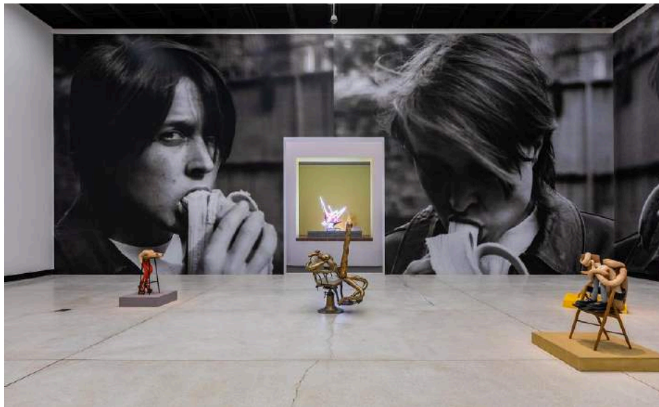
Installation view of 'Sarah Lucas' at Red Brick Art Museum, Beijing.

The English artist's debut in China is a celebration of androgyny, ambiguity and British bawdiness