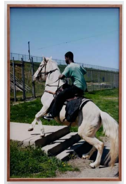
Merciless savaging of art is in part an enactment of dying by the sword that we have come to live by. Mohamed Bourouissa, Untitled (2013) © ADAGP Mohamed Bourouissa. Courtesy of the artist and Blum & Poe.

There is nothing like epic painting to set the bar high for big-picture thinking. Two shows of artists of very different generations, cultural backgrounds, and arcs in development have recently caught my eye. The first was an exhibition of two of the last monumentally scaled paintings made by James Rosenquist ,