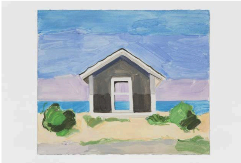
Maureen Gallace, Beach Shack, Door (2019). Courtesy the artist and Gladstone Gallery, New York and Brussels

the realm of the old-fashioned, but I couldn't discount that curators for which I have the greatest respect had been her earliest and steadfast supporters.