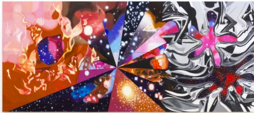
James Rosenquist, The Geometry of Fire (2011).

Rosenquist never seemed to develop a grounded art market base of support, like Johns or Lichtenstein , and many savvy viewers long ago dismissed his work as being of a specific moment. But I have always revered the quality of his brushwork, the panoramic scope of his imagery, and the consistent inventiveness. Without Rosenquist, I am certain that we wouldn’t have had the sweeping fascination for how content is depicted and its meaning formed in the work of Polke , Salle and many other touchstone artists of recent decades.