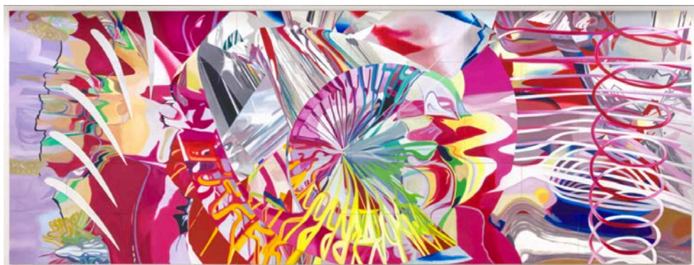
James Rosenquist, Joystick (2002) © 2019 Estate of James Rosenquist / Licensed by VAGA at Artists Rights Society (ARS), NY.

I n Other Words was always intended as a subjective, insider view of the art market and the salient issues facing the art world. I never thought that reviewing exhibitions would be critical to my introductions. And yet we are living in times in which the art market is increasingly consolidating around top-tier trophies made by a limited number of validated masters, punctuated by the occasional newcomer whose market tends to capture interest for a short period of time as a next-generation high-wire performer.