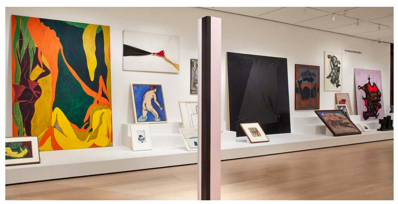
View of "Artist's Choice: Amy Sillman—The Shape of Shape," 2019–20, at the Museum of Modern Art, New York.

October 21, 2019 • Amy Sillman discusses "The Shape of Shape" at MoMA