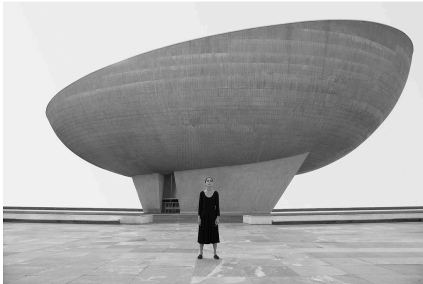
Shirin Neshat, Untitled , from the series "Roja" (2016).

Neshat is about to begin production on the film now and plans to complete it over the summer. Its premiere will coincide with the US debut of Neshat's monumental photographic portraits, "The Home of My Eyes," showing people from Azerbaijan whose bodies are inscribed with ink. The series has only been shown twice before, at Yarat Contemporary Art Space in Azerbaijan and Venice's Museo Correr during the 2017 Venice Biennale. Other large-scale photographic installations in the Broad show will include works from the artist's series "The Book of Kings" (2012) and " Our House Is on Fire " (2013).