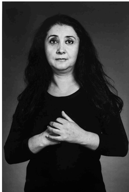
Shirin Neshat, Ilgara, from the series “The Home of My Eyes” (2015).

Land of Dreams is influenced by Surrealist filmmakers Man Ray and Maya Deren, but is based on Neshat’s own experiences as an Iranian-American who came to the US in 1975 and, at just 17, enrolled at the University of California at Berkeley. Neshat lived in exile throughout the Iranian Revolution of 1978-79, as well as the Iran-Iraq war of 1980-88, and continues to live in the US today.