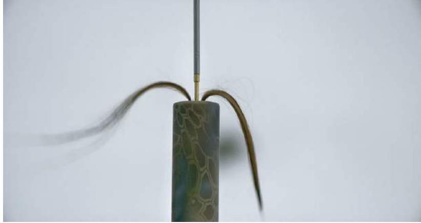
Still from Matthew Barney's Redoubt , 2018, 4K video, color, sound, 134 minutes 3 seconds.

While the feminine is all over Redoubt , the film refuses to essentialize the relationship between gender and the land, pushing against prosaic associations such as “female” nature at odds with conquering frontier men. Diana’s triad are a self-possessed matriarchy outfitted, for survival and kill, with the accessories of sport and the military-industrial complex. Diana’s earth-tone camouflage is a digital snakeskin design produced by Kryptek, a company whose products have passed laser-retinal-tracking tests performed by the Department of Defense. The trio bring to mind preppers, survivalists, and “sovereign citizens,” anti-government crusaders who are prime consumers of combat-grade tactical goods. Here, they are the protectors and stalkers of animals. Defense and offense. Diana embodies such contradictions, enacting a feminized law and order with weapons of the patriarchy while offering an alternative husbandry of the land to that of phallogentric, predatory heterosexuality.