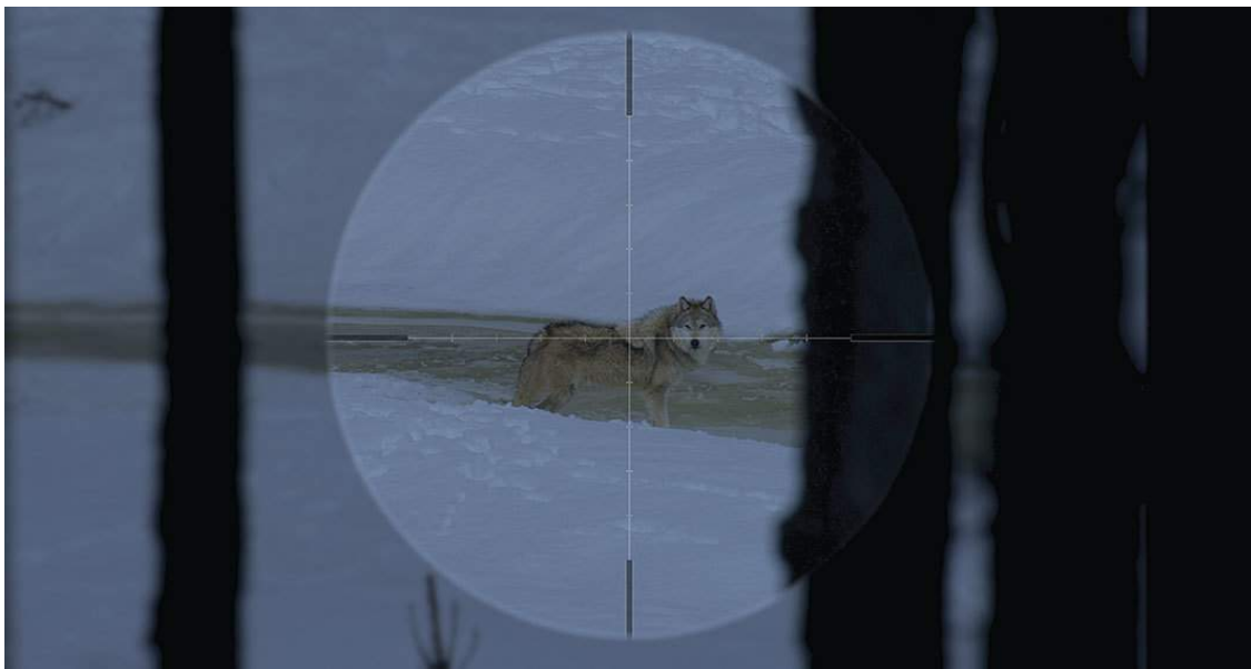
Matthew Barney, Redoubt , 2018, 4K video, color, sound, 134 minutes 3 seconds.