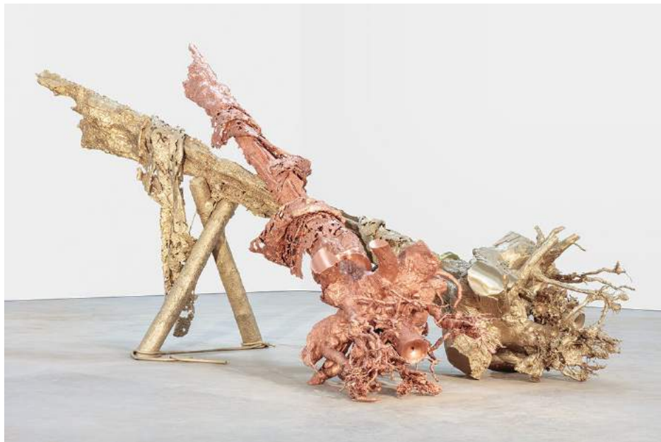
Matthew Barney, Virgins , 2018, brass, copper, 10' 3" × 20' 7 1/2" × 9' 5 1/2".