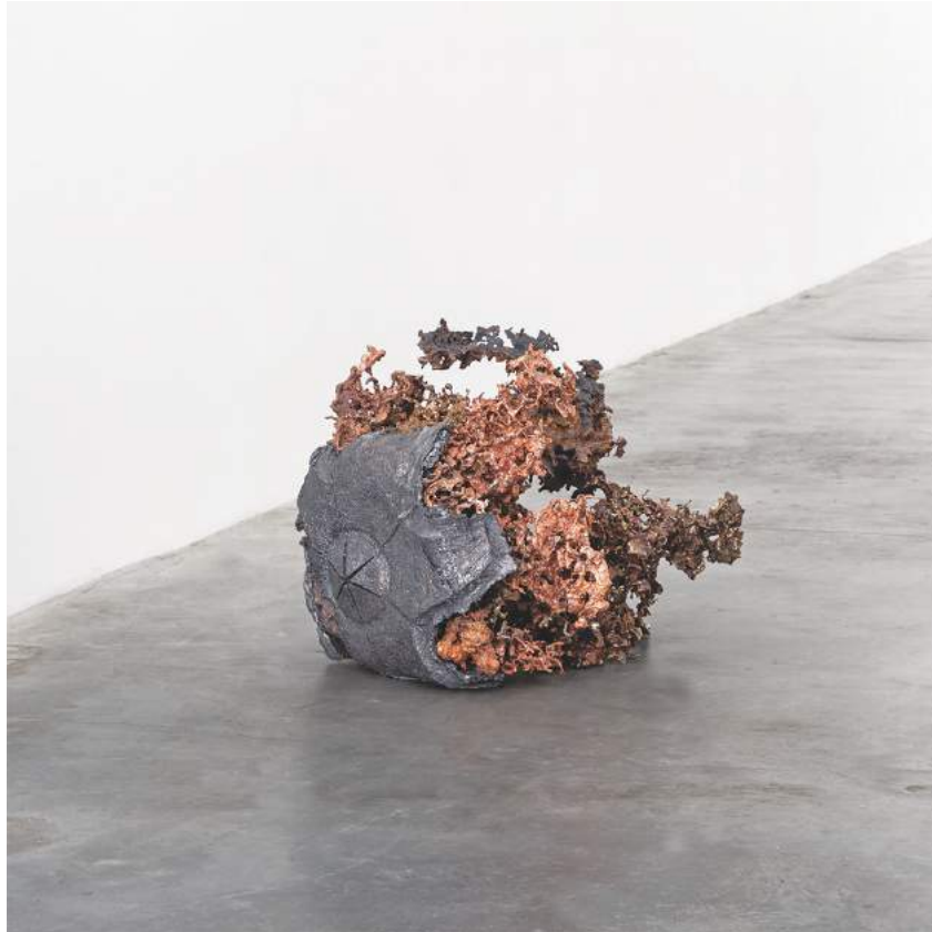
Matthew Barney, Slug , 2018, lead, copper, bronze, 27 × 32 × 28".

at an angle. In formal equilibrium, each of the trees seems to shed a skin, bark becoming classical drapery.