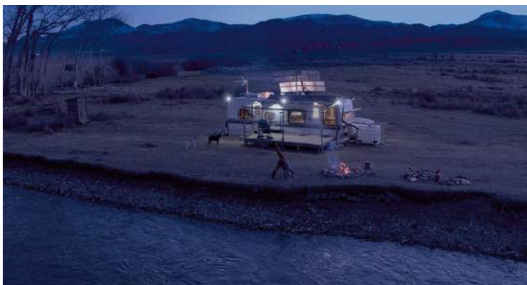
Still from Matthew Barney's Redoubt , 2018, 4K video, color, sound, 134 minutes 3 seconds.