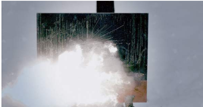
Still from Matthew Barney's Redoubt , 2018, 4K video, color, sound, 134 minutes 3 seconds.