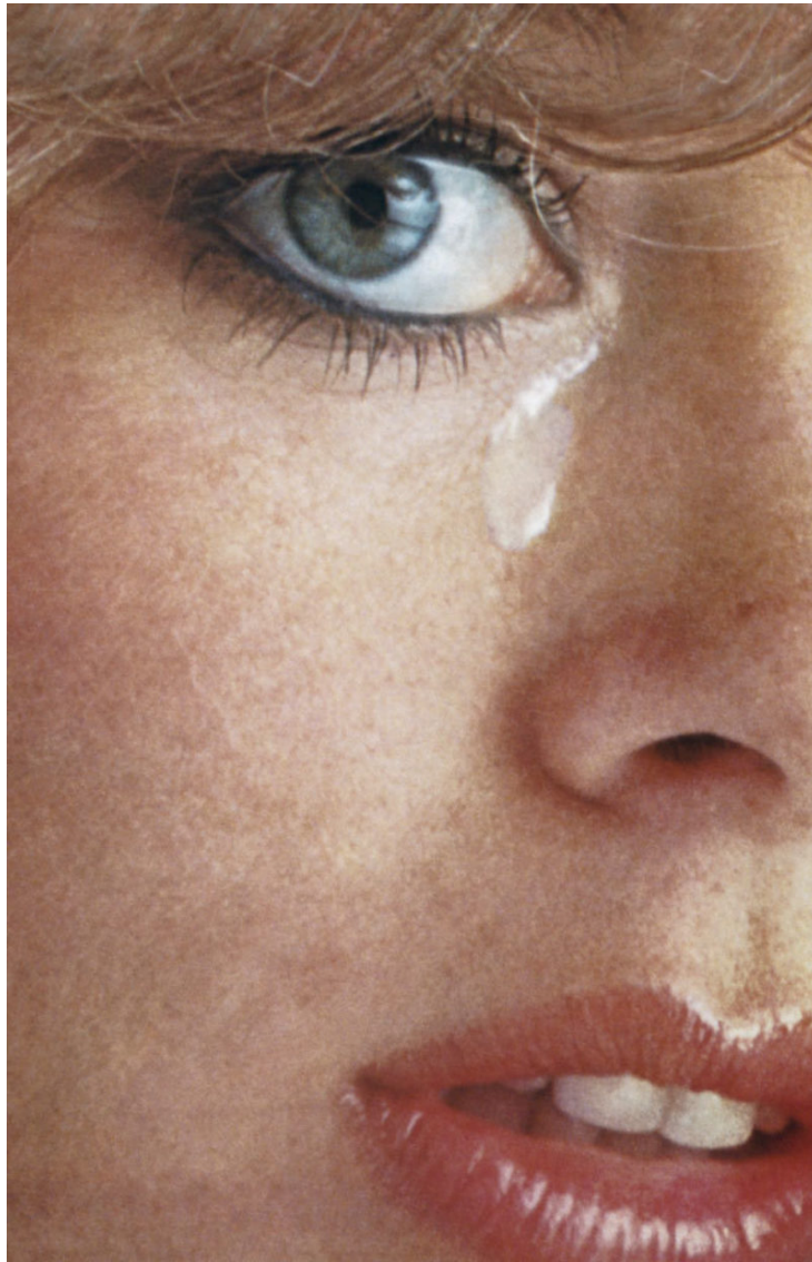
Anne Collier, Woman Crying #1 , 2016. C-print. 35.26 x 53 inches. Courtesy the artist and Anton Kern Gallery, New York.

the end of the nineteenth century, that onomatopoeia had entered colloquial use as we know it today: an ersatz copy of something purportedly truer and more deeply felt. There are always people onscreen or encased by a viewfinder whose emotions seem simultaneously manufactured and awash in authenticity. Each time, we feel that we have seen these people before, that they are a cliché; and each time we set that knowledge aside and view them with newly astonished eyes.