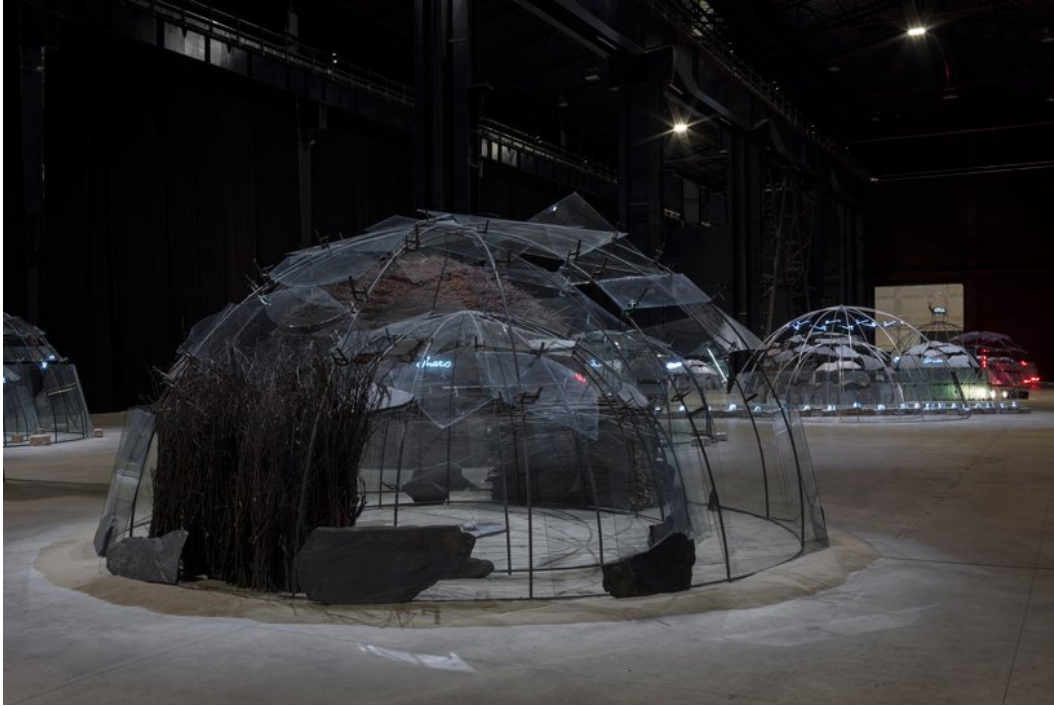
mario merz, igloo del palacio de las alhajas, 1982 installation view at pirelli hangarbicocca, milano, 2018. museo nacional centro de arte reina sofía, madrid © mario merz, by siae 2018