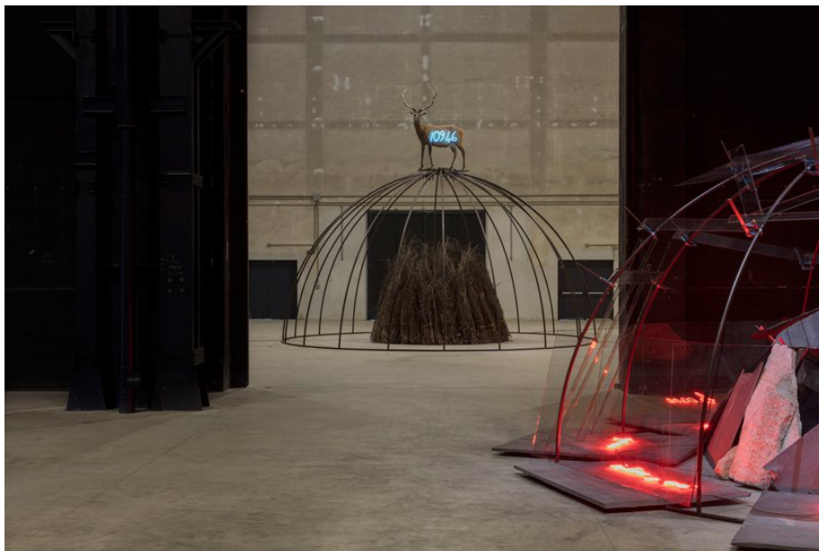
igloos, exhibition view at pirelli hangarbicocca, milan, 2018. © mario merz, by siae 2018