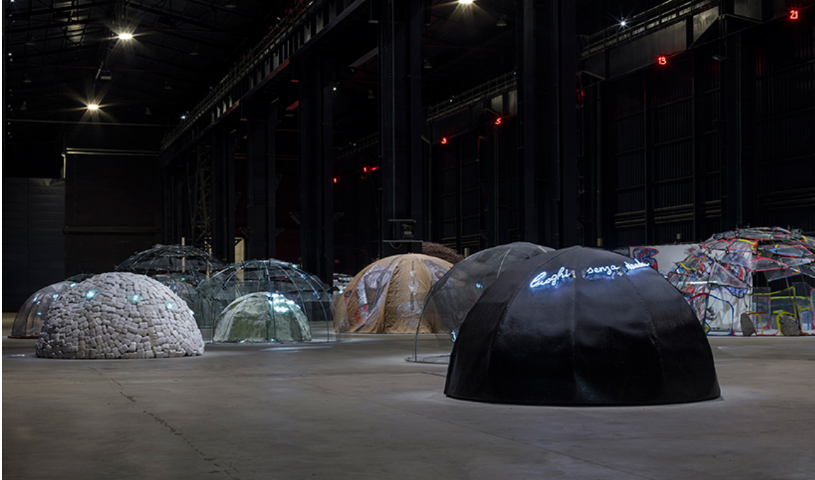
mario merz, "igloos", exhibition view at pirelli hangarbicocca, milan, 2018 © mario merz, by siae 2018

gathered from numerous private collections and international museums — including madrid's reina sofia, london's tate and berlin's nationalgalerie — the exhibition curated by HangarBicocca's vicente todolí provides an overview of merz's work. overall, the show highlights how the artist developed his igloo imagery with coherence and vision and reveals innovative aspects and themes of his research. the different use of natural and industrial materials, together with the poetic and evocative deployment of the written word and relationship with its surrounding space inserted the works within the international contemporary artistic panorama.