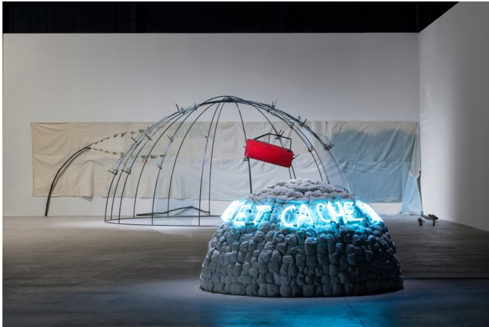
mario merz igloos, exhibition view at pirelli hangarbicocca, milan, 2018. © mario merz, by siae 2018