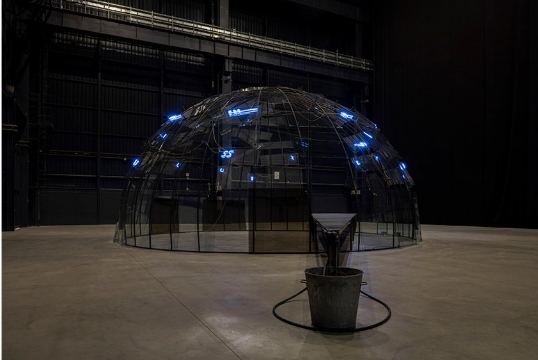
mario merz, la goccia d'acqua, 1987 installation view at pirelli hangarbicocca, milan, 2018. staatliche museen zu berlin, nationalgalerie courtesy pirelli hangarbicocca, milan photo: renato ghiazza © mario merz, by siae 2018

vicente todolí said, 'as its starting point, the exhibition 'igloos' takes mario merz's solo show curated by harald szeemann in 1985 at the kunsthhaus in zurich, where all the types of igloos produced up until that point were brought together to be arranged 'as a village, a town, a 'città irreale' in the large exhibition hall,' as szeemann states. our exhibition at pirelli hangarbicocca will be a once-in-a-generation opportunity to re-live that experience (but expanded from 17 to more than 30 igloos) created by one of the most important artists of the post-war generation.'