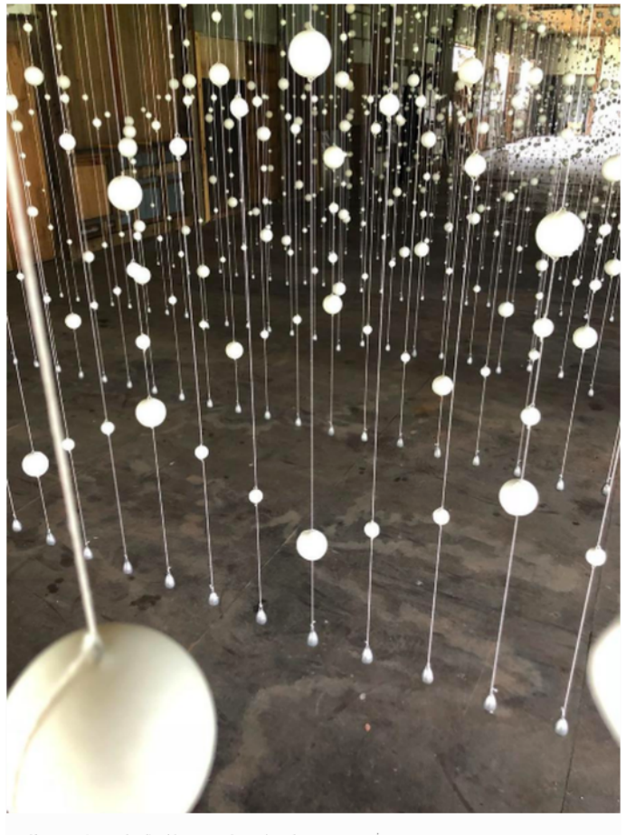
Damián Ortega 'Wrap Cloud' Echigo-Tsumari Art Triennale, Japan DAMIÁN ORTEGA

And he's at it again for this latest exhibition which sees spheres of plaster and lead formed to resemble water drops, attached to singular threads. The balls are held in place due to the tension generated by the weight of the lead. They're also organized in a way where the composition seems like a unified form that crosses a three-dimensional network of plains that connect visually. This gives the appearance of a large cloud of molecules that occupies the space.