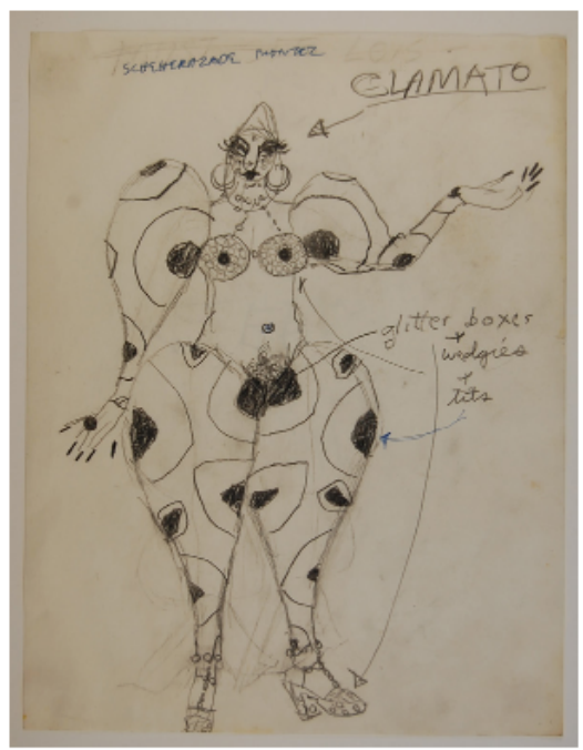
Jack Smith. Untitled , c. 1968, Mixed media on paper, 11 × 8 ½ inches.

Descriptors of "lobsters" representing greedy landlords dominate: "lobster moons of Atlantis popping out of violent volcanoes," complement "lobsters reeling out of lizard lounges sunsets." There are lobster-lucky landlord paradises, moon mixed media spectacles, sunset Christmas pageants, (and gala parties) and lobster moon pageants . There's boiled lobster rainbow-rama color, and a drawn woman—on a stage set of a stage set—drink in hand, meeting a big lobster resting on a step ladder's bottom rung. Smith scribbled notes about lobster positioning below.