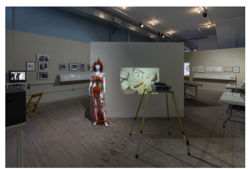
Installation view of Jack Smith: Art Crust of Spiritual Oasis, June 22 - September 9, 2018.

ARTISTS SPACE | JUNE 22 - SEPTEMBER 9, 2018