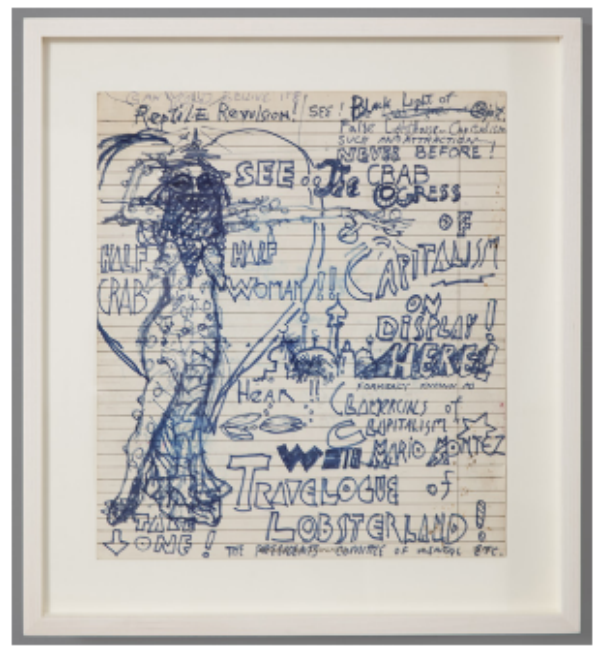
Jack Smith. Travelogue of Lobsterland! (Formerly known as Clamercials of Clapitalism), c. 1968, Ink and felt-tip pen on paper, 9 1/8 × 8 inches.

Salvaged remnants scrawled on tattered notebook paper or stained with rubber cement underline Smith's immersive commitment—as unconventionally original and combinative as Bowie's. Weaving through the compelling vitrines, tables, slideshows and monitors of this down-to-earth aesthetic garage sale hurls one out of the basement, where half the show is, into a sibylline trap door to heaven where Smith's "moldy aesthetic" thrives.