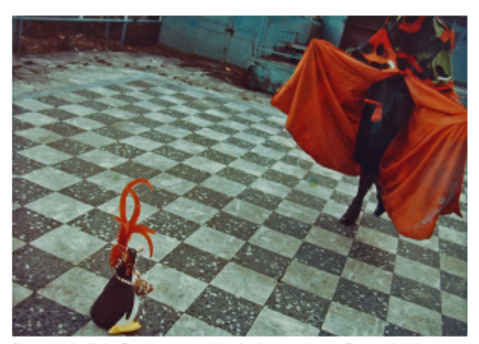
Scanned slide from an untitled photo shoot featuring Smith as the Lobster, c. 1970s - 1980s; Courtesy of Artists Space, New York and Gladstone Gallery, New York and Brussels

I include these word lists because they are breathing evidence from posters, scripts, plays, movies, slideshows, photos and drawings flowing one into the next that Smith used to blur his content barriers, just as Intermedia merged "platforms" in those days. This striking fluidity, rarely as radical as it is in Smiths output, is worthy of new exploration. By internally reimagining tenantlandlord and gay-straight struggles, Smith destroyed home-workplace, script-production, and artist-audience dichotomies exemplifying how content, media, art, and life overlap one other.