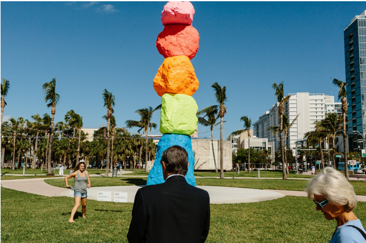
The candy-colored “Miami Mountain,” by the Swiss artist Ugo Rondinone, is also outside the Bass Museum.

The fair itself has new digs, too, or at least refreshed ones: The hulking Miami Beach Convention Center, a few blocks from the Atlantic and home to some 250 galleries, is in the midst of a long-overdue refresher, its faded Art Deco facade reclad with dark glass.