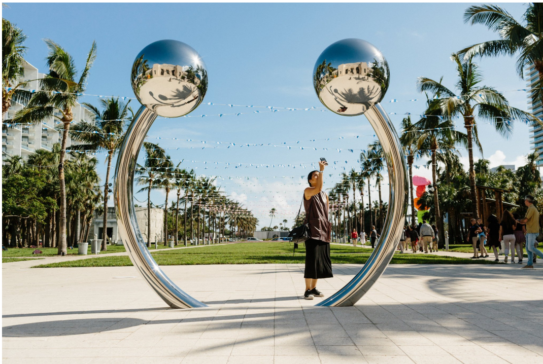
Daniel Knorr's sculpture "Navel of the World," outside the newly renovated Bass Museum in Miami Beach.

MIAMI BEACH — This year's edition of Art Basel Miami Beach , America's premier contemporary-art entrepôt and air-kissing arena, was always bound to take place against a backdrop of construction. This city, after all, loves real estate as much as it does art, and two museums — the veteran Bass Museum and the new Institute of Contemporary Art, Miami — have spiffy new homes to show off.