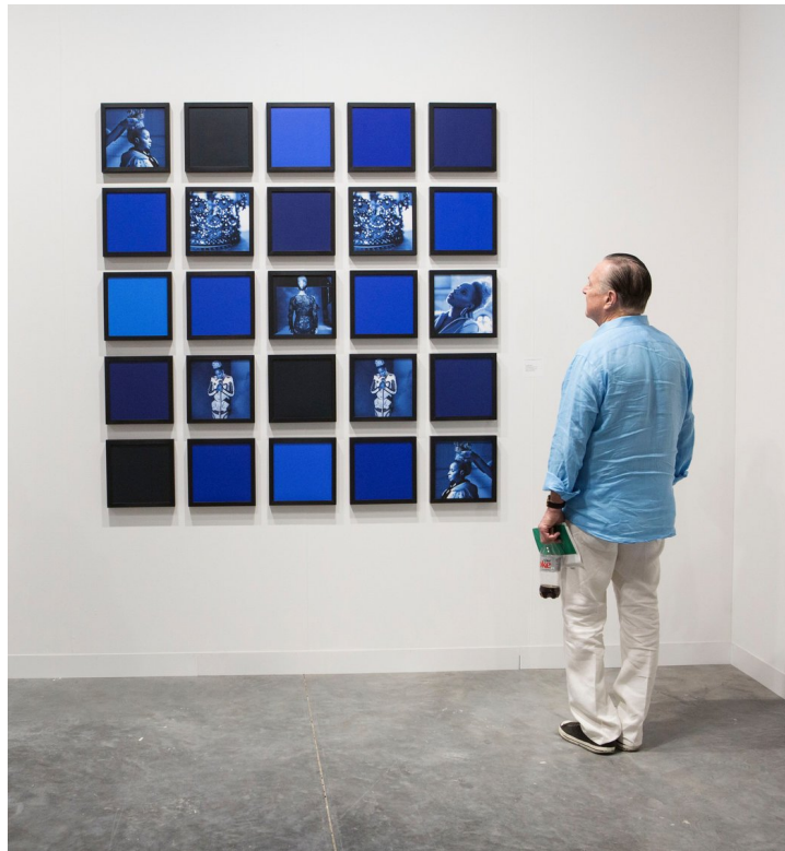
Carrie Mae Weems's "The Blues," a series of tinted photographs of the singer Mary J. Blige, at Jack Shainman Gallery's booth at the fair.