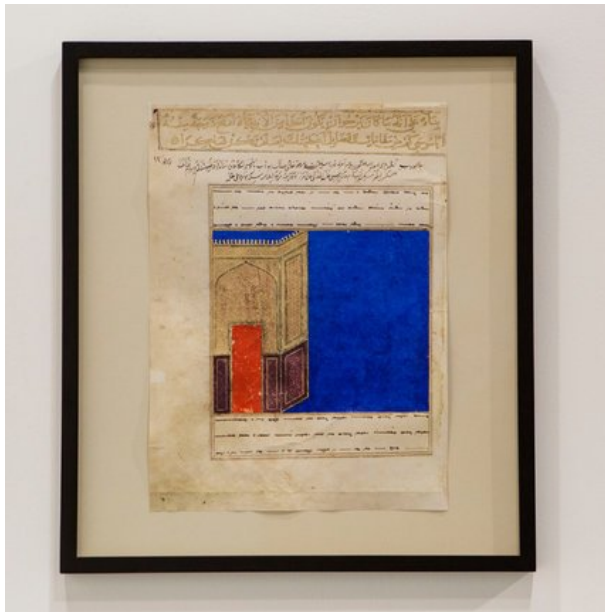
“After Moses” (2017), a painting by the Iranian artist Shahpour Pouyan, at Galerie Nathalie Obadia at Art Basel Miami Beach.

Man”), a disquieting painting from 1950, three women — the Fates, or just an artist’s models? — sit in judgment over a splayed young man, perhaps in postcoital slumber, perhaps murdered.