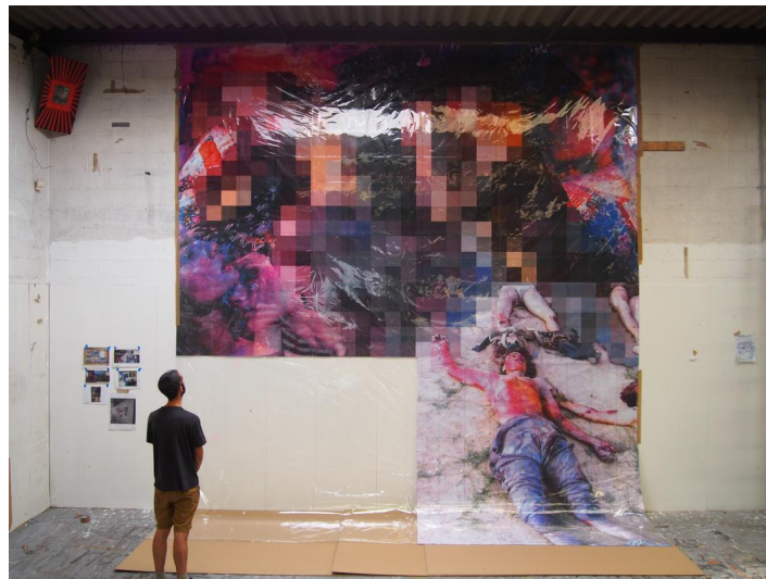
Thomas Hirschhorn, Pixel-Collage n°110 , 2017 (studio view). Courtesy of the artist and Gladstone Gallery, New York Photo: Romain Lopez

Like Rosler, Hirschhorn addresses the way we consume (or refuse to consume) images of conflict. In accepting pixelated images uncritically there is a suggestion that we are acquiescing to the activities of the censor. We internalize the idea that we don't want to see these violent images—we fear the friction they might create in our passage through social media, or the upset they might cause us when eating dinner in front of the news. In pixelating the advertising photo specifically, Hirschhorn nudges the association between capitalism and conflict a step further: "A pixelated image is always the worst thing," he explains. "If something is pixelated I immediately think it's the worst. If something is pixelated there's already a power to it."