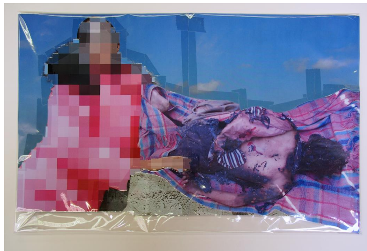
Thomas Hirschhorn, Pixel-Collage n°97 , 2017. Courtesy of the artist and Gladstone Gallery, New York Photo: Romain Lopez

While pixelation is nominally a protective gesture, Hirschhorn reads it as insidious. Whether it's concealing fake news or masking the full facts, he sees this widespread practice as contributing to a post-truth culture. The general acceptance of the pixelated imagery also suggests complicity; the censor protects us from disturbing imagery, and in accepting the masked version of events, we permit ourselves to be infantilized, placed at a distance from reality. It is this distance that Hirschhorn aims to dissolve.