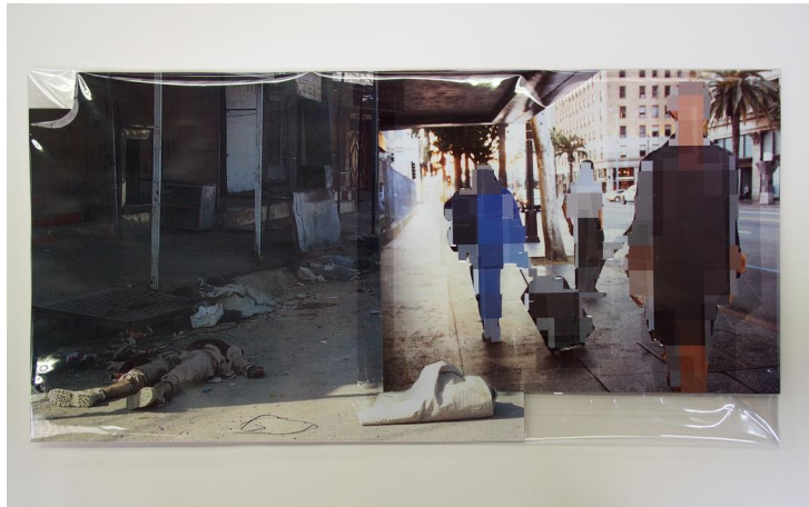
Thomas Hirschhorn, Pixel-Collage n°106, 2017.

The Gladstone Gallery exhibition marks the culmination of the project. Over the course of two years, Hirschhorn has made 121 collages: a body of works ranging in dimensions from magazine to billboard scale that he now considers substantial enough to have an impact. For the artist, the initial pushback that he received was a sign that he was producing something potentially transformative "I am not surprised; each artwork is received with resistance," he says. "I the artist also must resist; I am very happy that I can push myself."