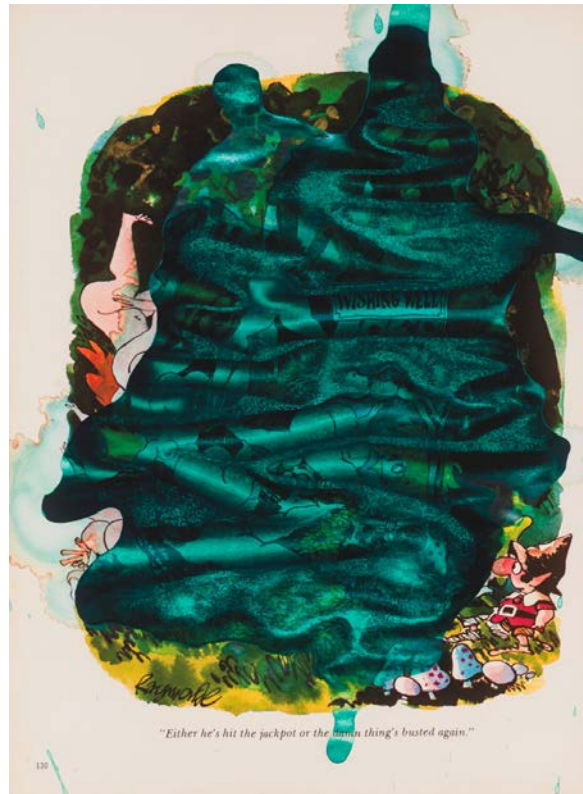
Richard Prince, Untitled (#130) (2016).

From Richard Prince's new paintings to a leading Latin American Modernist