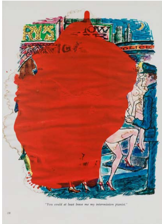
Richard Prince, Untitled (#130) (2016-17). Courtesy Gladstone Gallery, New York and Brussels

Some of his finest bodies of work, in my opinion, have remained relative bargains while, on occasion, some of his less powerful work have become most coveted by the market. (This is similar to the ways in which the market for Picasso in recent years has placed so much more value in the decoratively beautiful portraits of the 1930s over the revolutionary analytic Cubist paintings made between 1910 and 1912.)