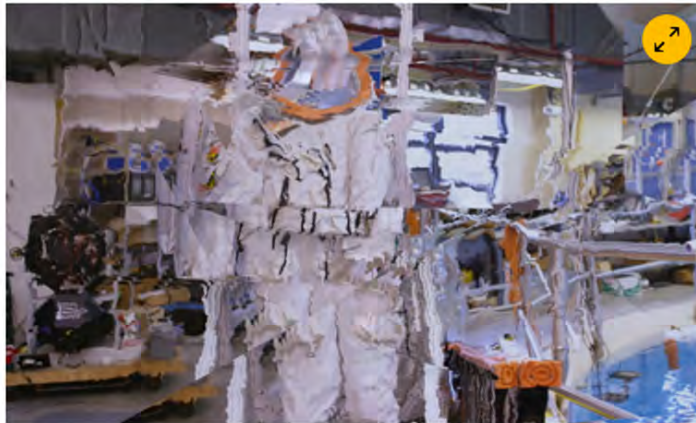
📷 A still from Rachel Rose's Everything and More (2015).

From space, the Earth appears to plunge into night every 45 minutes. Floating over the dark planet on a moonless night in a sky blacker than you thought possible, all the Earth might look like to you, says Nasa astronaut David Wolf , "is the absence of stars ... You can reach into a shadow so black that your arm can appear to disappear."