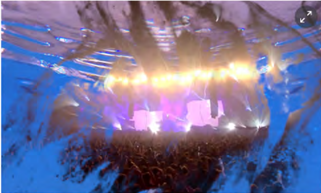
Everything and More: the title was taken from a book by David Foster Wallace.