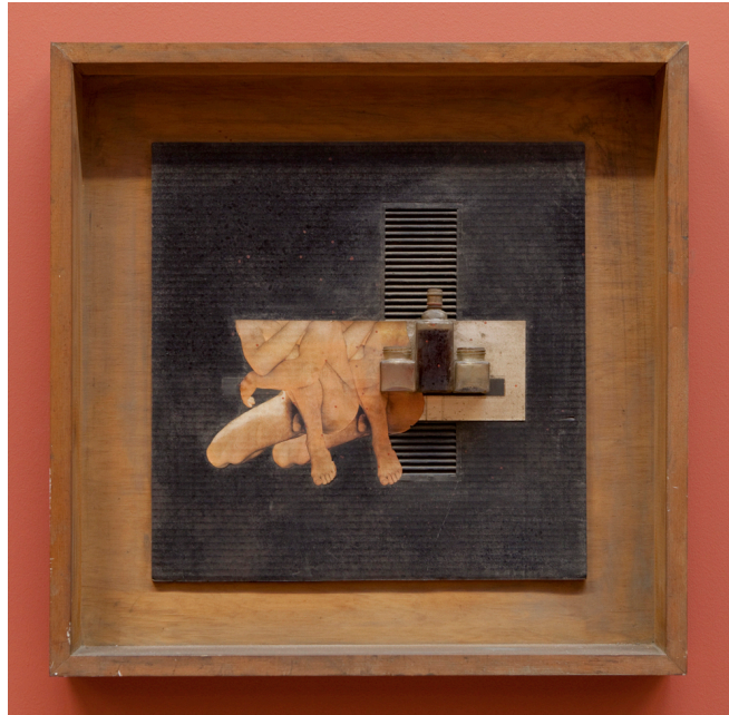
Hudinilson Jr, McLellan Galleries

claws pasted with gay porn are slowly released from their elastic bands. The glacial pace, and sheer oddity of the images, make for compulsive watching.