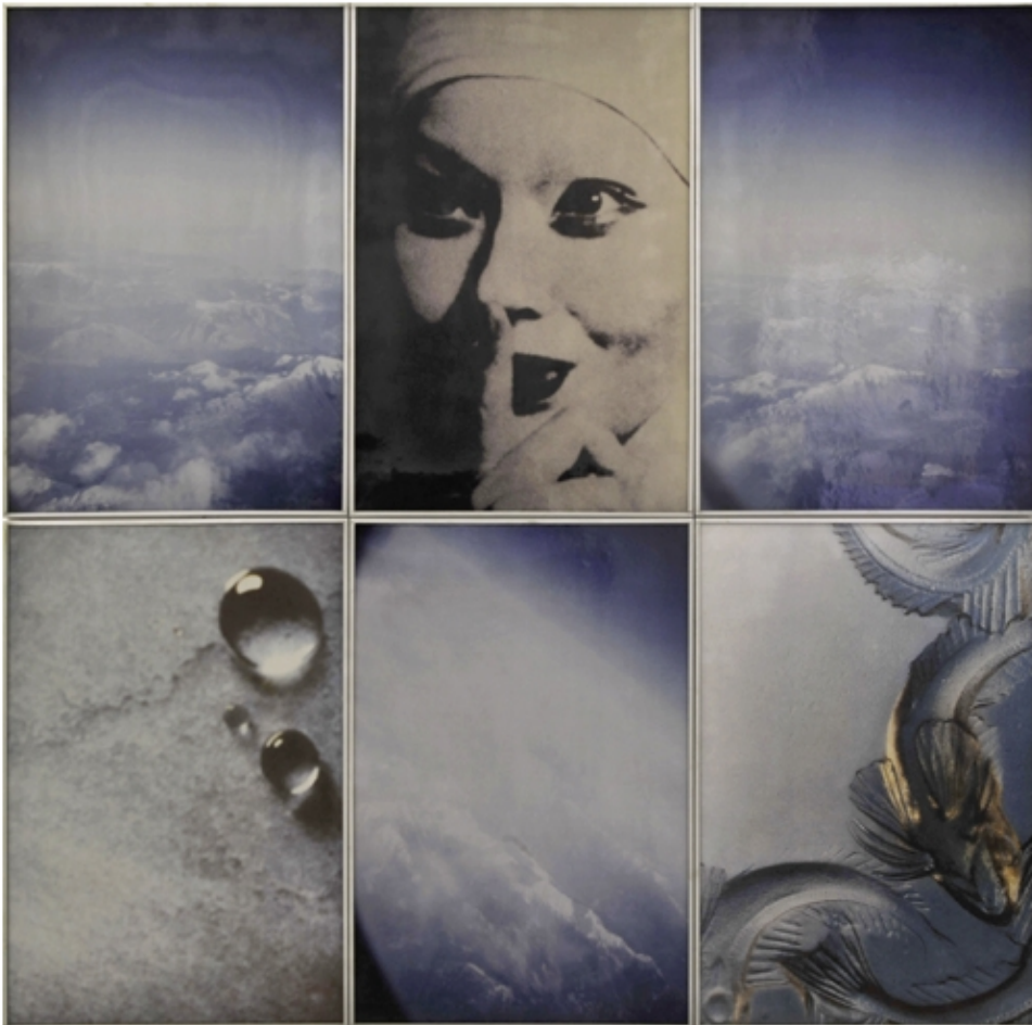
Birgit Jürgenssen, Untitled (Nun) 1990, colour photographs behind fabric