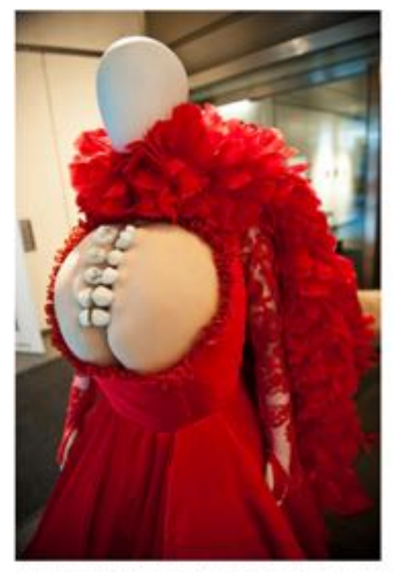
Clarina Beznola, "When I walk alone in the streets ... " (2021)

unconventional work, the exhibition includes glamour queens in swimsuits, evening wear and talent performances.