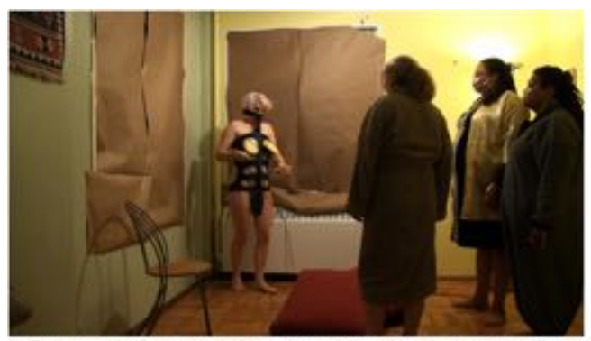
Still from Maria Petschnig's "Coaching Session"s (2011), 4-channel HD video projection, 7 minutes

To picture Maria Petchnig's videos, think of obese men and women throwing a sex party inside the Salvation Army. What is shocking is not the subject matter but the lack of feeling the footage illicits. To be blunt, it's boring. Like most porn, the participants engage in repetitive, robotic movements and the camera's point of view is fixed. The only difference the videos offer is a cast of unattractive characters. The one video of hers that I did find captivating involved a group of senior residents exercising in an old folks home. There is something poignant about watching a group of men and women on the precipice of death trying to keep their muscles limber.