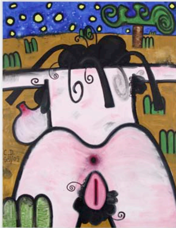
"(Hers) Night and Day" (2009). Acrylic on canvas, 66 × 51 inches (167.6 × 129.5 cm).

Dunham: I only came to them through drawing; the whole thing evolved visually. So there was never any question of my having a preconception of what I was going to be illustrating. As I've pointed out in the past, it isn't precisely that they're blind—it's just that they never developed eyes [laughter]. There is no particular metaphor about blindness in my mind; it's just that when I tried to draw characters in my work with eyes they didn't feel comfortable as part of the image, so I had to eliminate that feature altogether. What it means psychologically or how one might extrapolate a story from that isn't on my mind when I'm working.