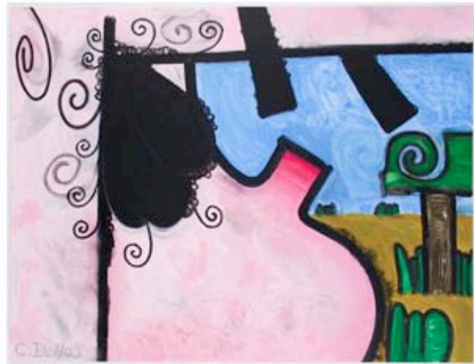
"(Hers) Night and Day" (2009). Acrylic on canvas, 51 x 66 inches (129.5 x 167.6 cm). Copyright Carroll Dunham. Courtesy Gladstone Gallery.

Rail: Also, in [George] Berkeley's "Essay on the New Field of Vision" he proposes that spatial experience was predominantly a tactile phenomenon. Let's say a man born blind being made to see would at first have no idea of distance by sight. Yet the objects intromitted by sight would seem to him no more than a set of thoughts or sensations, each as near to him