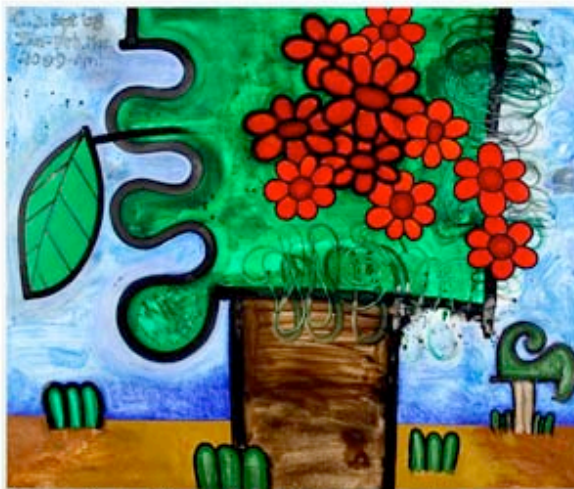
"Tree with Red Flowers" (2009). Mixed media on canvas, 75 x 90 inches (190.5 x 228.6 cm).